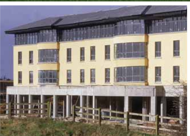
Park Hotel, Mullingar

The CPI EuroMix range includes other decorative products for a comprehensive design solution. Coloured Mortar Specify CPI EuroMix Coloured Mortars to ensure the highest quality brickwork that will complement perfectly the selected render finish. Hydraulic Lime Render Our range of hydraulic lime mortars and renders is produced to the same high standards as our cement based products. Ideal for heritage projects, whether refurbishment or new build. Further details available on request.