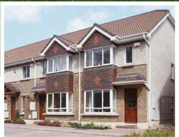
Ashtown Residential Development, Co. Dublin