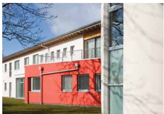
Eastfield Medical Centre, Edinburgh