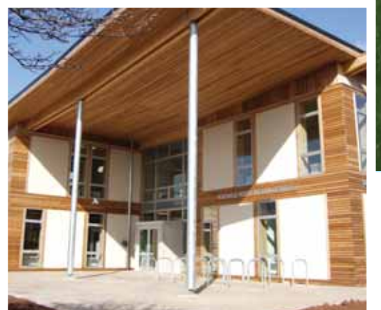
Knowle West Media Centre, Bristol