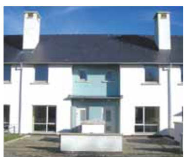
Social housing scheme, Blessington

Now, following intensive research and product development, we have expanded our range to include high performance renders, offering the same high standards of quality and service. EuroMix Renders already have a track record of success on prestige projects. Our unrivalled technical know-how and expertise, combined with the uniquely personal service of our sales and customer service personnel, result in an unbeatable package.