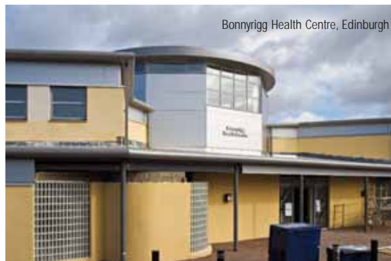
Bonnyrigg Health Centre, Edinburgh

Unrivalled customer service – We listen to our customers and will continue to respond to their needs for products and systems that offer real on-site benefits.